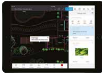
AutoCAD mobile app for iOS