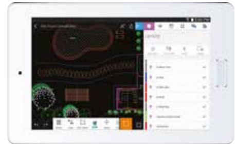
AutoCAD mobile app for Android